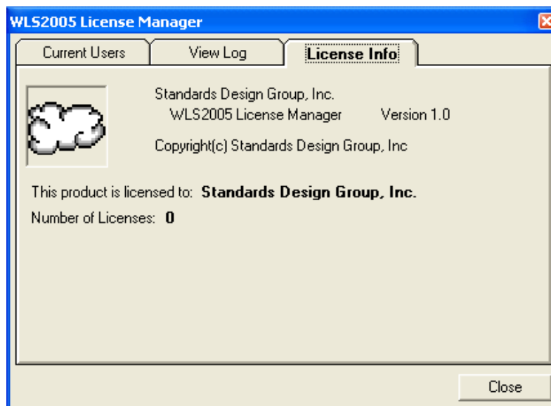
License Info tab in License Manager Program

The License Information tab lists the owners of the license and the number of licenses.